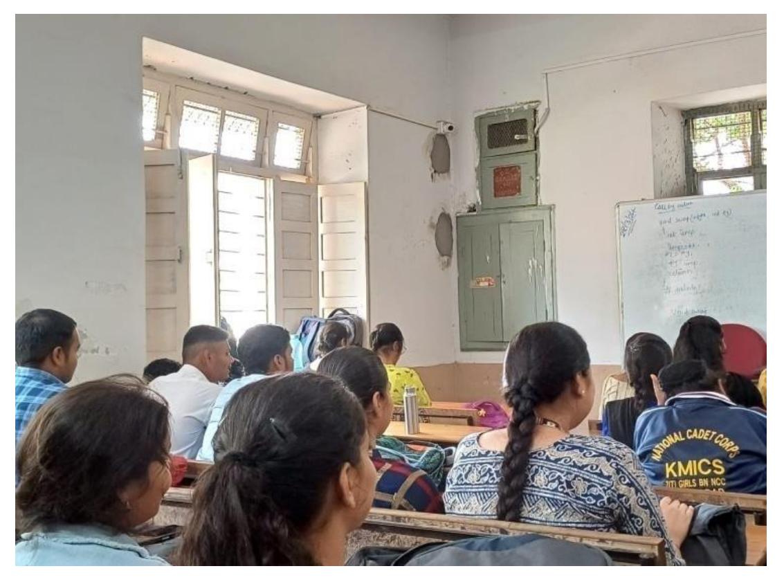
CCTV camera in classrooms